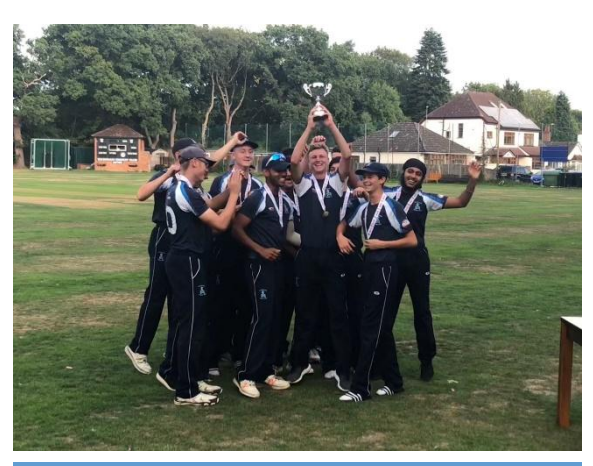
Our U21 winning the Middlesex Development League in 2019

The Club is purely a non-profit organization and is seeking sponsorship revenue to reinvest into club facilities to improve the standard of cricket and develop the friendly atmosphere at Ickenham. Sponsorship revenue is typically spent on: